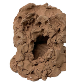
Crier (IX) / 2021 Fired clay