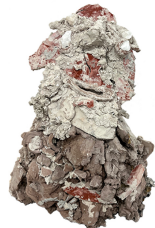
30 Crier (XXVIII) / 2022 Unfired clay, stones