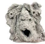
Crier (XVI) / 2022 Unfired clay, stones