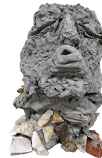
Crier (XIII) / 2021 Fired clay