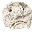
Crier (XXI) / 2022 Unfired clay