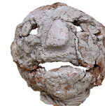
25 Crier (XXVII) / 2022 Unfired clay