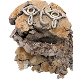
16 Crier (XXIII) / 2022 Unfired clay