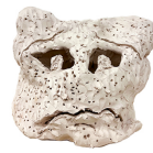
Crier (VIII) / 2021 Fired clay