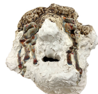
29 Crier (XX) / 2022 Fired clay, glaze